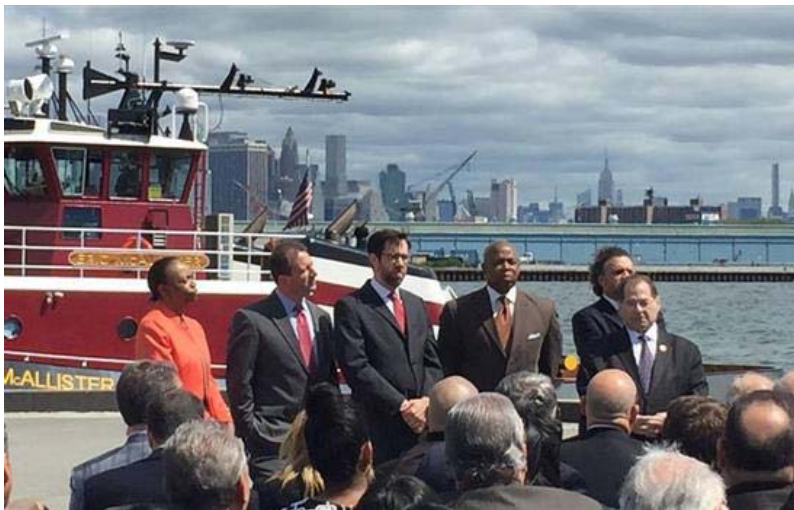
Rep. Nadler speaking about efforts to establish a container and shipping port along the Bay Ridge Channel in Brooklyn.

For the past thirty years, I have passionately advocated for the development of a container port in Brooklyn. Therefore, I was extremely pleased that Mayor Bill de Blasio announced his Administration's commitment to the phased development of a major deep-water container port centered at the South Brooklyn Marine Terminal earlier this summer. Cargo ships will now be able to dock directly in Brooklyn, bringing industrial jobs, transportation infrastructure, and opportunities for growth to the area.